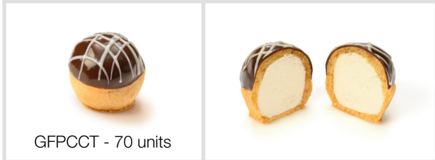
Patisserie Cream Profiterole