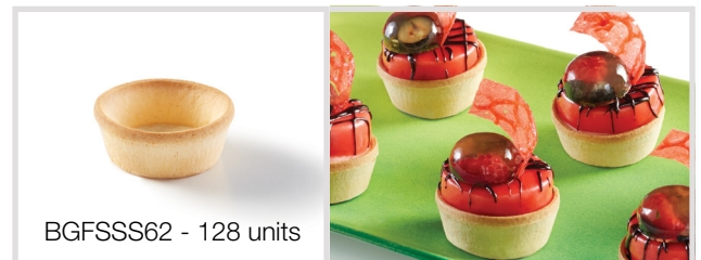
62mm BAKED Shortbread Shell (Straight Sided)