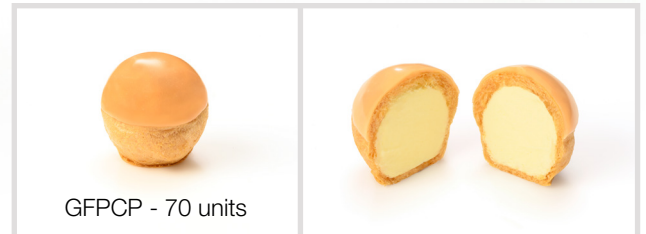
Passionfruit Curd Profiterole