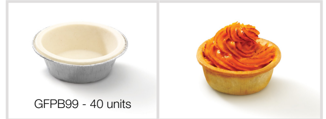
99mm Savoury Pie Shell