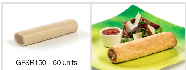
150mm Beef Sausage Roll