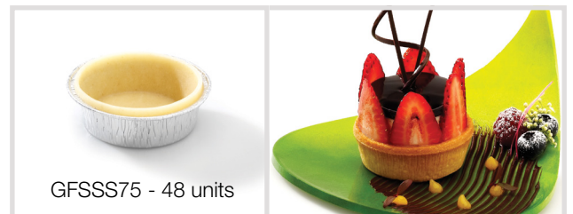
75mm Shortbread Shell (Straight Sided)