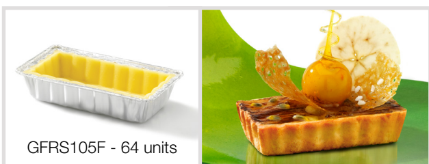
105mm Rectangle Fluted Shortbread Shell