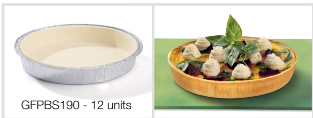
190mm Savoury Pie Shell