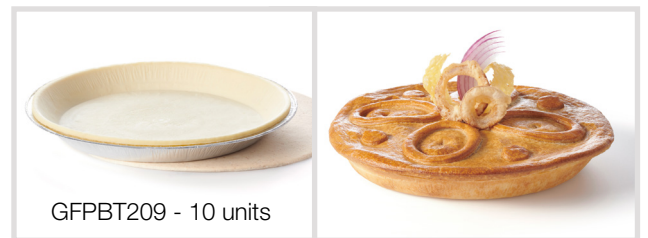
209mm Savoury Pie Shell with matching Puff Pie Top