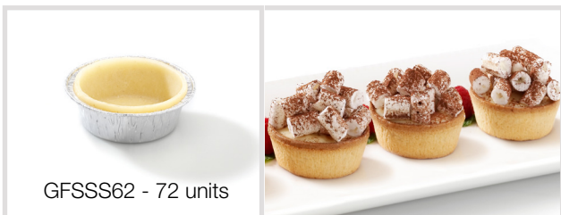
62mm Shortbread Shell (Straight Sided)